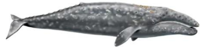
gray whale (Eschrichtius robustus) length up to 15 m (49 ft)