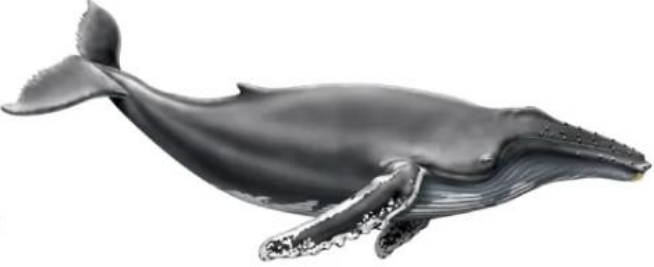
humpback whale (Megaptera novaeangliae) average length 14 m (46 ft)