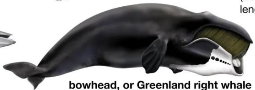
bowhead, or Greenland right whale (Balaena mysticetus) length up to 20 m (66 ft)