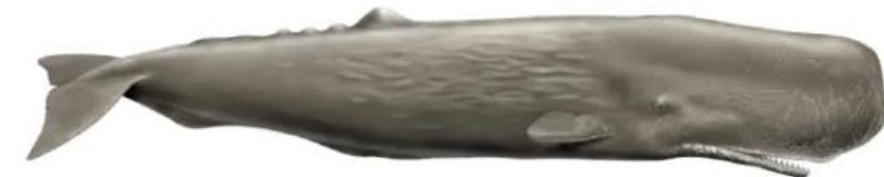
sperm whale (Physeter macrocephalus) length up to 24 m (79 ft)