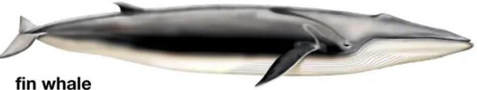
fin whale (Balaenoptera physalus) length up to 27 m (89 ft)