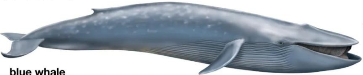
blue whale (Balaenoptera musculus) length up to 29.5 m (97 ft)