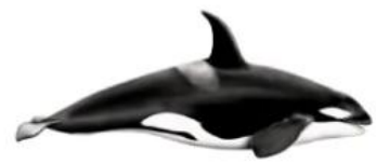
killer whale, or orca (Orcinus orca) average length 8 m (26 ft)